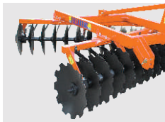
Combination of plain & notched disc (Boron steel)