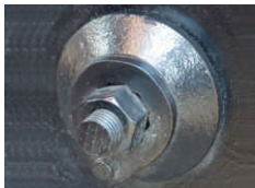
Gang axle lock